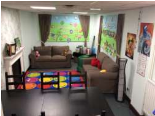
The Nurture Room

The school employs a full-time family support officer who supports pupils with emotional, social and behaviour difficulties. Early Help referrals can be made by the school and as part of Early Help, regular half-termly 'Team Around the Family' meetings can be arranged to further help families with supporting children who need pastoral support. We provide Nurture Group interventions to help pupils with these difficulties and in some cases access counselling or Play Therapy. The school's anti-bullying policy is followed to help prevent bullying of pupils receiving pastoral support.