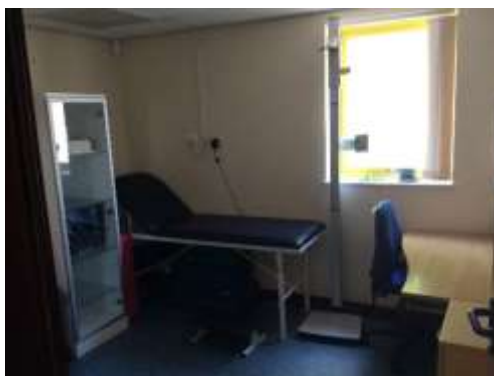
The Medical Room

The school also has a medical room where pupils with medical needs can go and receive any treatment. The school has catered for pupils with diabetes, Cystic Fibrosis, epilepsy and many other conditions. The school works closely with a School Nurse and other medical practitioners. Staff training is arranged with different bespoke medical departments to ensure the staff are confident and competent in supporting pupils with medical conditions. The medical room can be used in the event of a pupil having an accident. The majority of our Teaching Assistants, dinner ladies and admin staff are trained first aiders. The school follows the 2014 legislation: Supporting Pupils with Medical Needs.