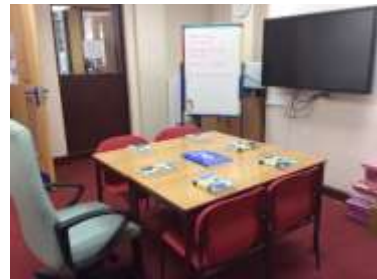
Key Stage 2 Room

In 2021, the school introduced an additional area for a Year 1 transition room. This room provides a targeted provision for pupils who have moved into Key Stage 1 but still require a play-base environment to develop key skills.