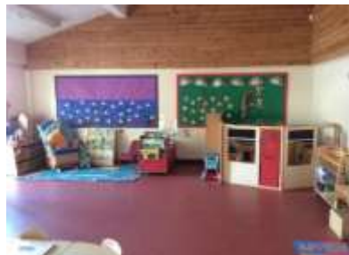
Key Stage 1 Transition Room

Sporting facilities include a large indoor hall, two smaller halls, outdoor playgrounds, an enclosed school field and our wonderful Multi Games Area.