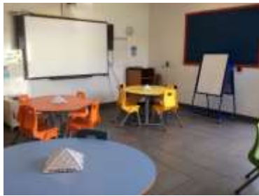
The Lighthouse Room

At present, there are a three dedicated interventions rooms situated throughout the school where group interventions can take place. Furthermore, we have a learning support bases allocated to each year group where Teaching Assistances can take pupils to work at a 1:1 level or in a small group.