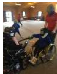
Pioneer Residential Visit: assisted Climbing, wheelchair abseiling, specialist archery and wheelchair fencing