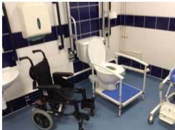
Our Care Room

The school has two disabled toilets and a purpose-built care room with hoisting and shower facilities. The care room allows school to cater for children who are unable to access the toilets without being hoisted. Staff are trained in Safer People Handling and to safely operate the hoist. There are 3 spare wheelchairs for any pupils to use. When used, these are often for pupil who have had a temporary fracture. The school site is wheelchair accessible and there is a lift to access the two different floors of the school building.