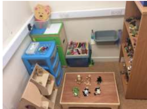
Play Therapy Room

The school site contains Dudley Environmental Zone and the school gets frequent opportunity to use this beautiful oasis. The Environmental Education Officer runs half-termly sessions for small groups of selected pupils. These twice-weekly sessions are designed around Forest School initiatives in order to help pupils build up key skills such as team-working, communication and empathy. The sessions also foster pupils' self-regulation skills, builds up their resilience and improves problem-solving skills.